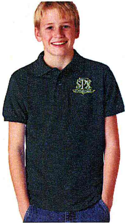
STP-1 Embroidery Short Sleeve Polo Shirt Colors: Navy, Forest Green or White Adult Sizes: Small - 3Xlarge* Youth Sizes: Small-Large